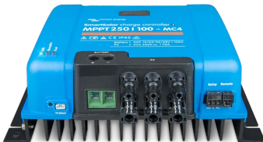
SmartSolar Charge Controller MPPT 250/100-MC4 without display