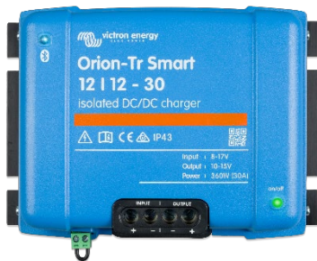
Orion-Tr Smart 12/12-30