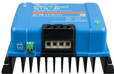
Orion-Tr Smart 12/12-30